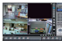
GKB Envoy™ Software NVR10