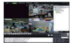
GKB Envoy™ Viewer11